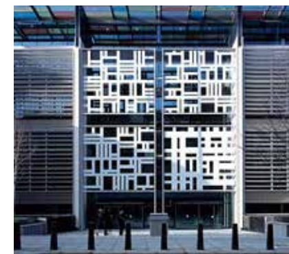
THE HOME OFFICE LONDON