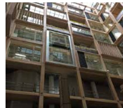
ANCHORAGE PLACE ATRIUM