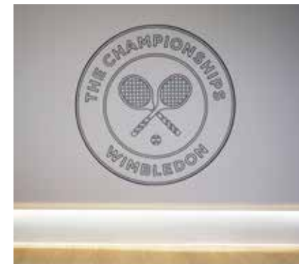
WIMBLEDON TENNIS CLUB