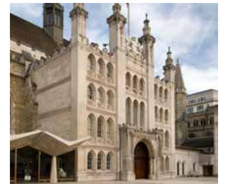
THE LONDON GUILDHALL