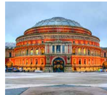
THE ROYAL ALBERT HALL