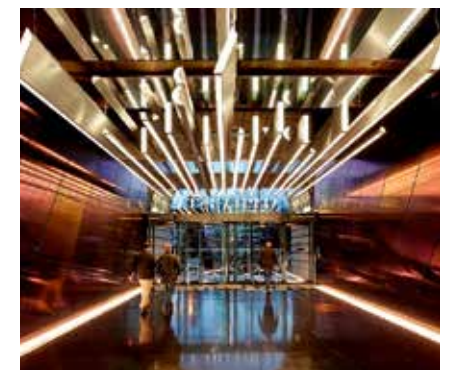
ALPHABETA OFFICE BUILDING, LONDON