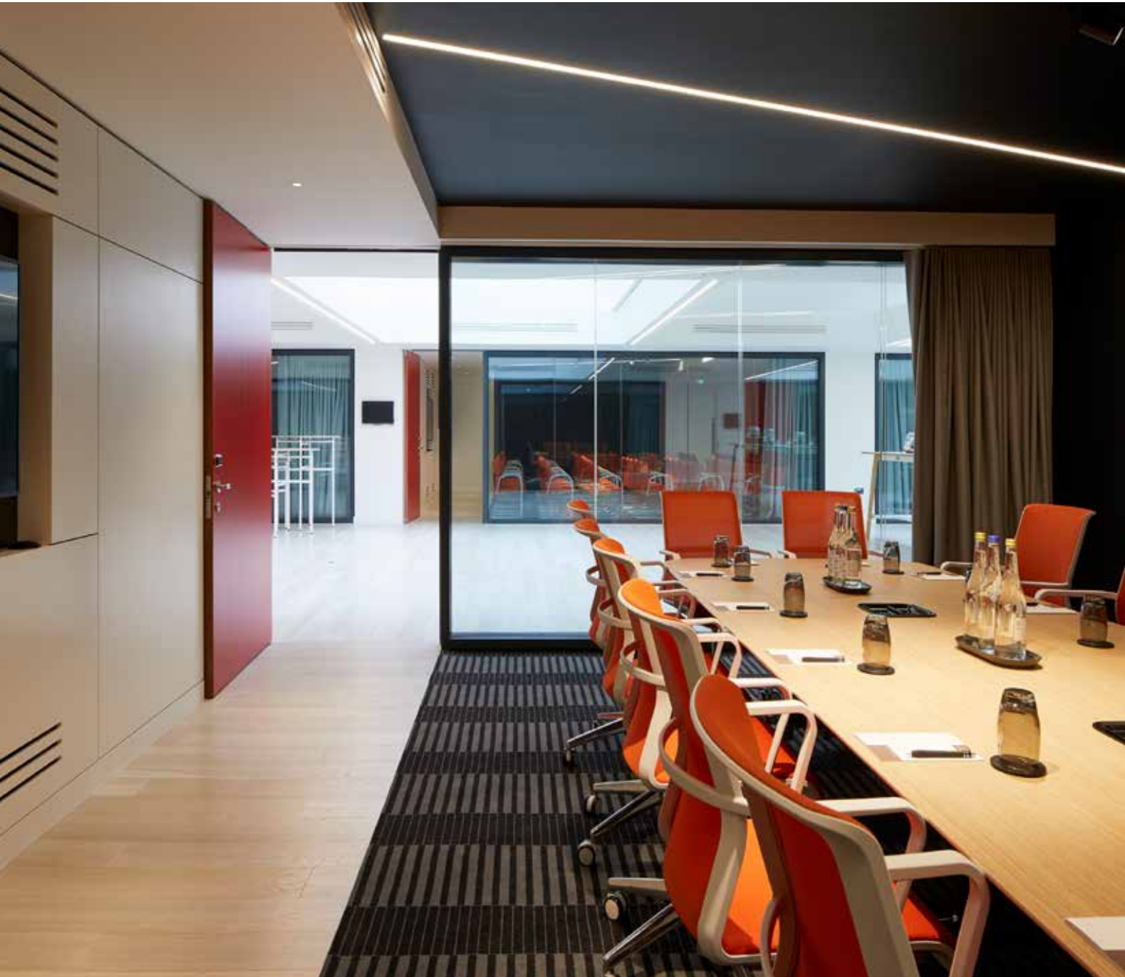
Apex City of Bath Hotel

A highly skilled and experienced specialist joinery contractor concentrating on luxury hotels, apartments and commercial projects, covering London and the South East.